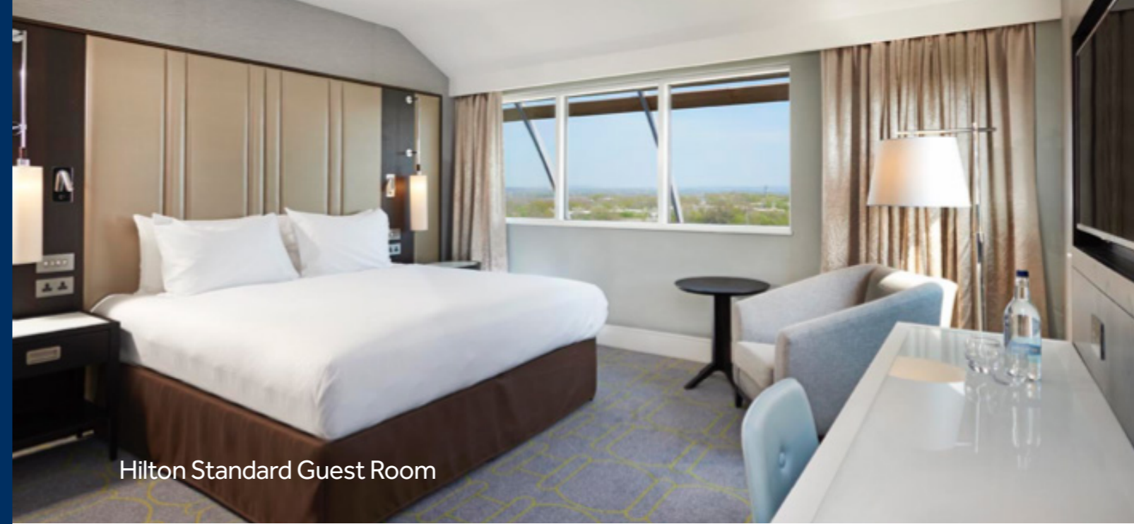
Hilton Standard Guest Room