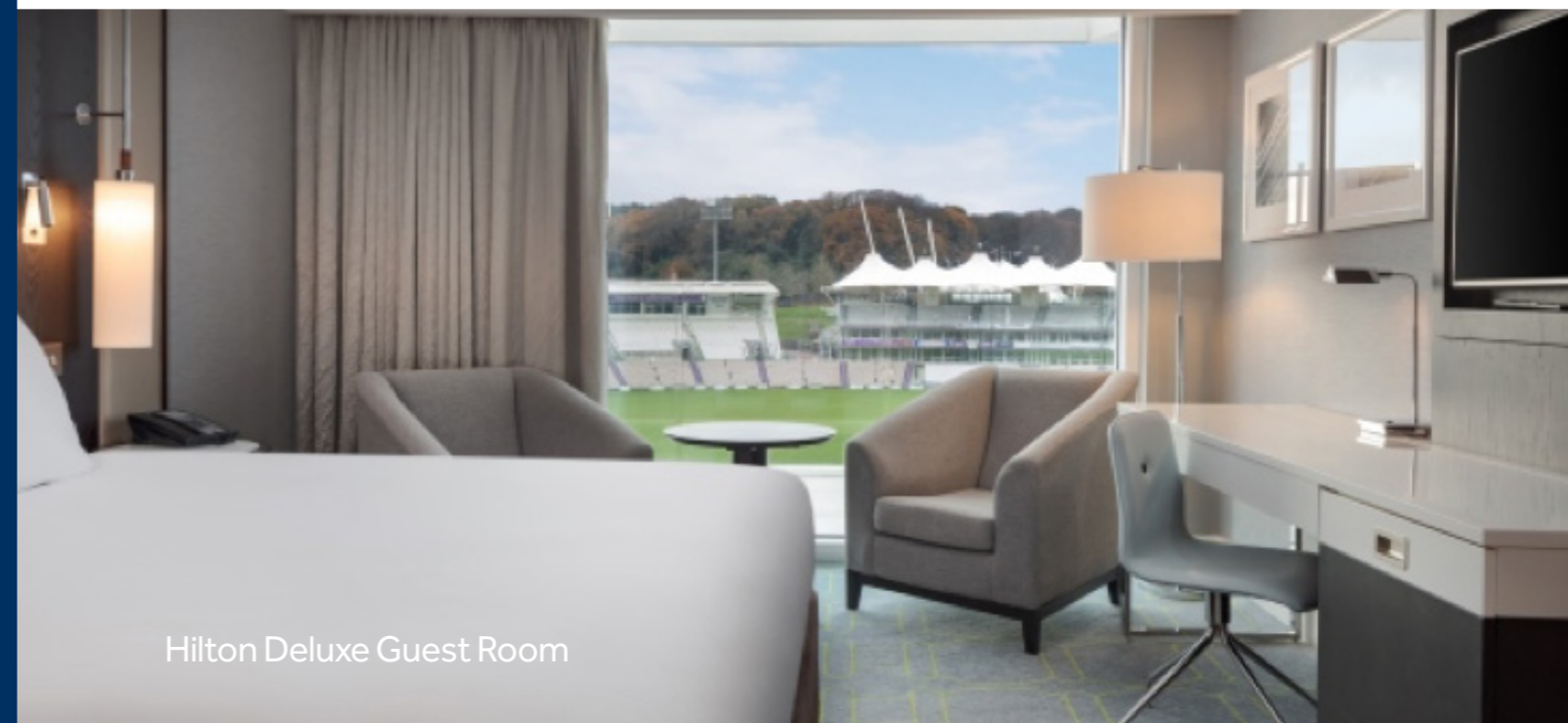
Hilton Deluxe Guest Room